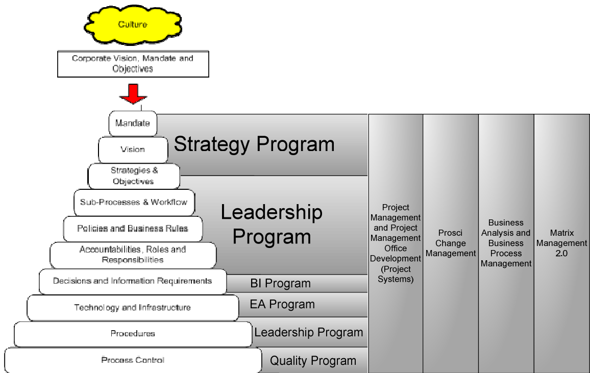
Figure 3: Oxford Libero Consulting Comprehensive Program Model

To support our comprehensive program requires the ability to deliver. Our project management/program management program ensures that the implementation is well managed and strategically focused. Our change management program ensures the support of the people in the organization for the change which quickens the impact of the initiative and ensures the organization meets its