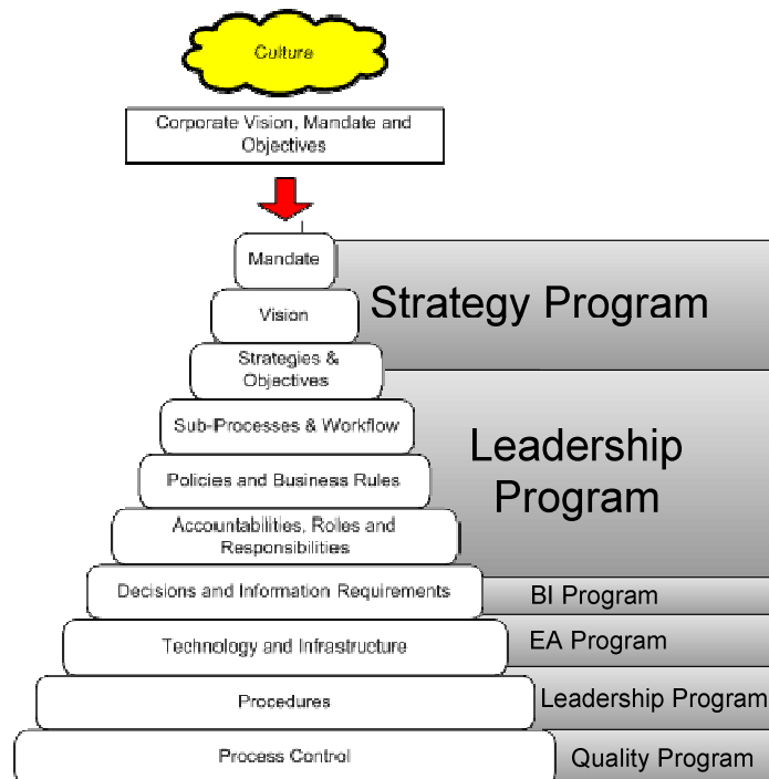
Figure 2: Oxford Libero Consulting Delivery Program

We can offer each of our programs independently. For organizations looking to effect significant change, all of our programs seamlessly integrate into a single program. By combining our: Strategy Program; Leadership Program; Business Intelligence Program; Enterprise Architecture and Quality Program, we are able to completely redesign and implement a comprehensive and sustainable change for your organization (Figure 2).